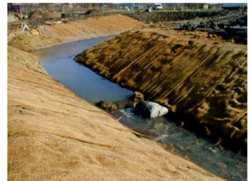
Installation, spring 2001