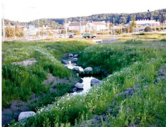
3 months after installation